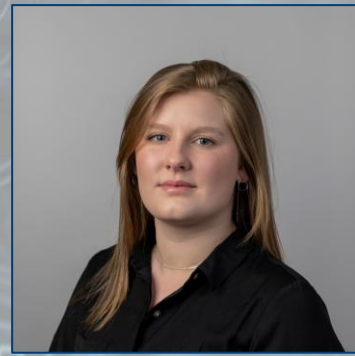
Greer Templar Wilmington Urban Area MPO